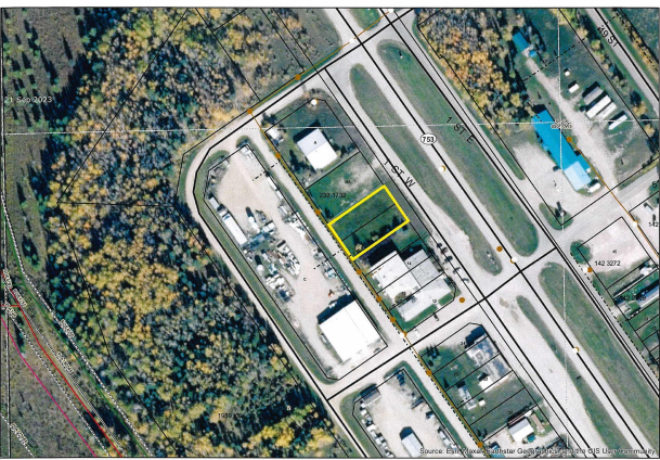
5122 & 5118 50A St

Great location along the main street in Cynthia. West Pembina Field Office is directly beside these two lots. The water and sewer are on the property line in the back alley. This is a main Hwy for traffic and Great exposure to for your business. Priced to sell!